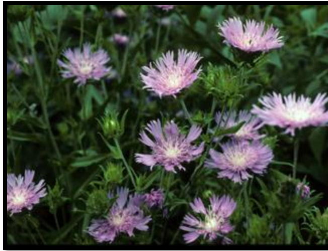
Stokes' Asters

For hanging baskets, or regular containers as single specimens or mixed with other wildflowers: